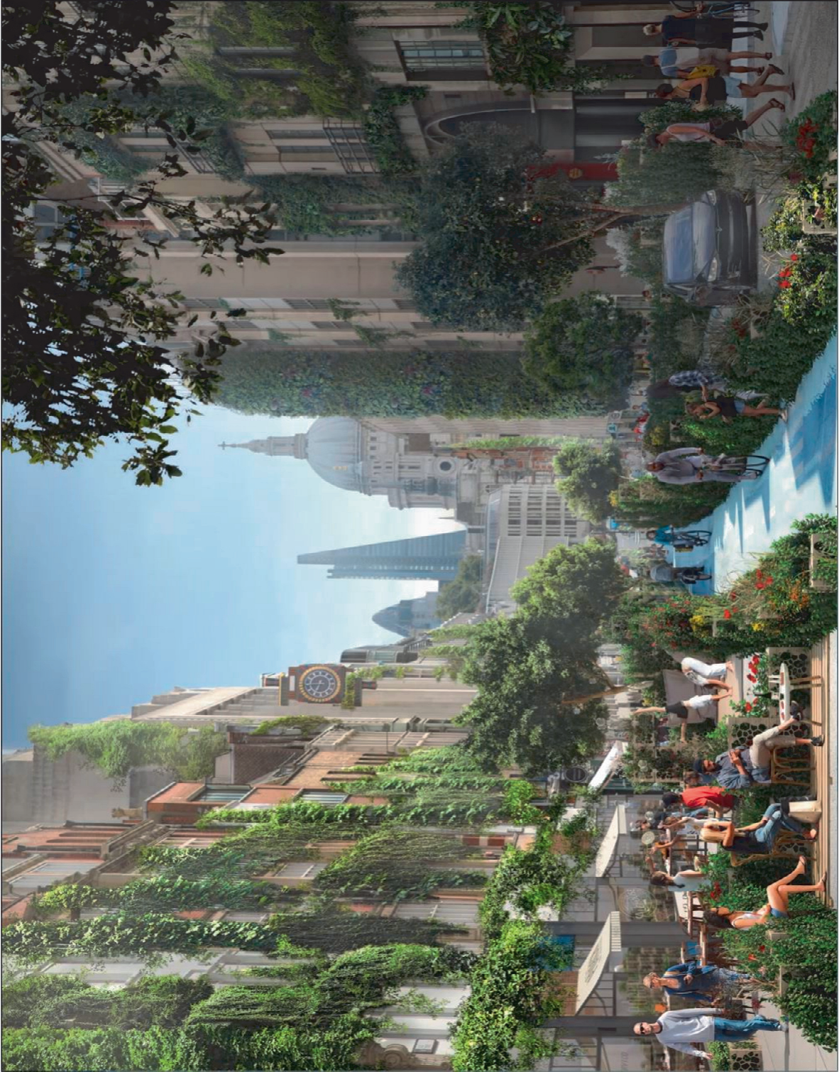
Wimberly, Allison, Tong & Go, www.watg.com (architectural firm), 10 October 2017