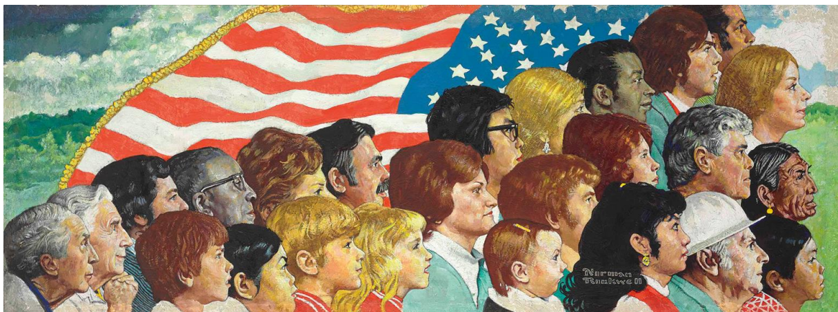
Norman Rockwell, Spirit of America , 1974

Look at Norman Rockwell's painting: what does it say about the American nation? Why do people choose to leave their country and start a new life in the USA nowadays?