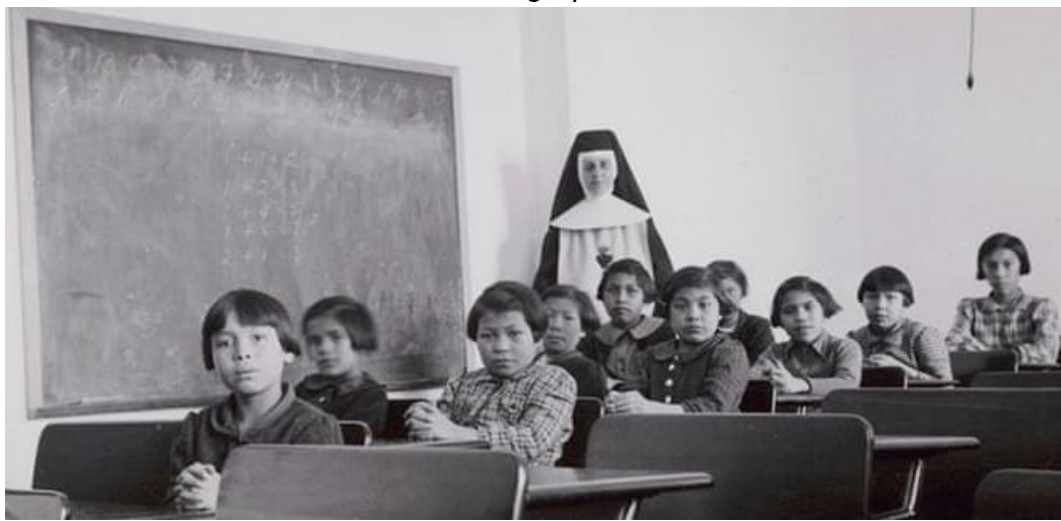
Female students and a nun pose in a classroom at Cross Lake Indian Residential School, Manitoba, February 1940.