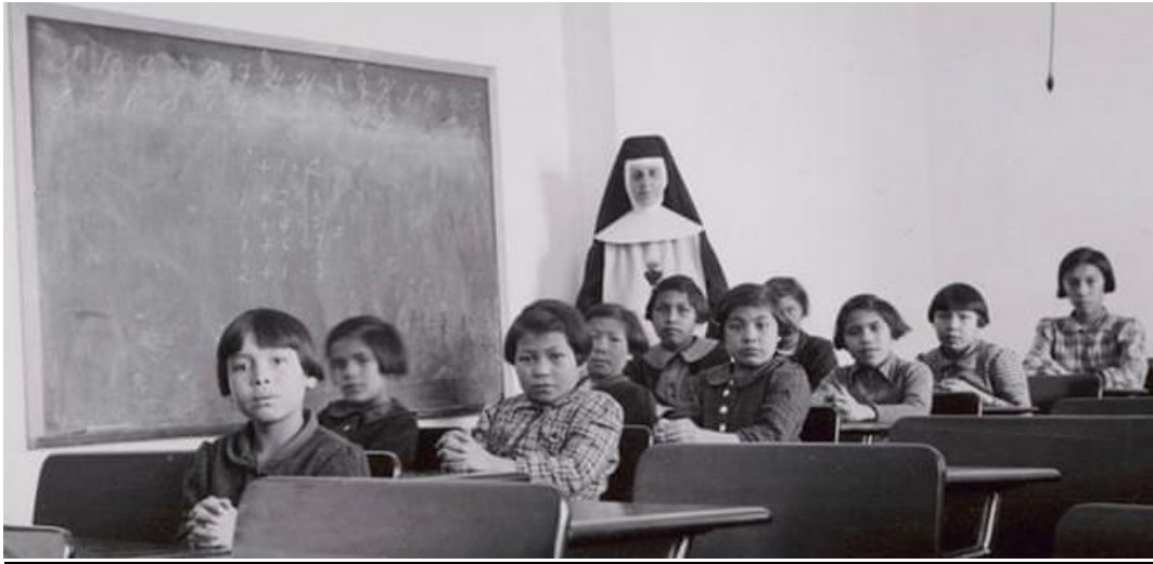
Female students and a nun pose in a classroom at Cross Lake Indian Residential School, Manitoba, February 1940.