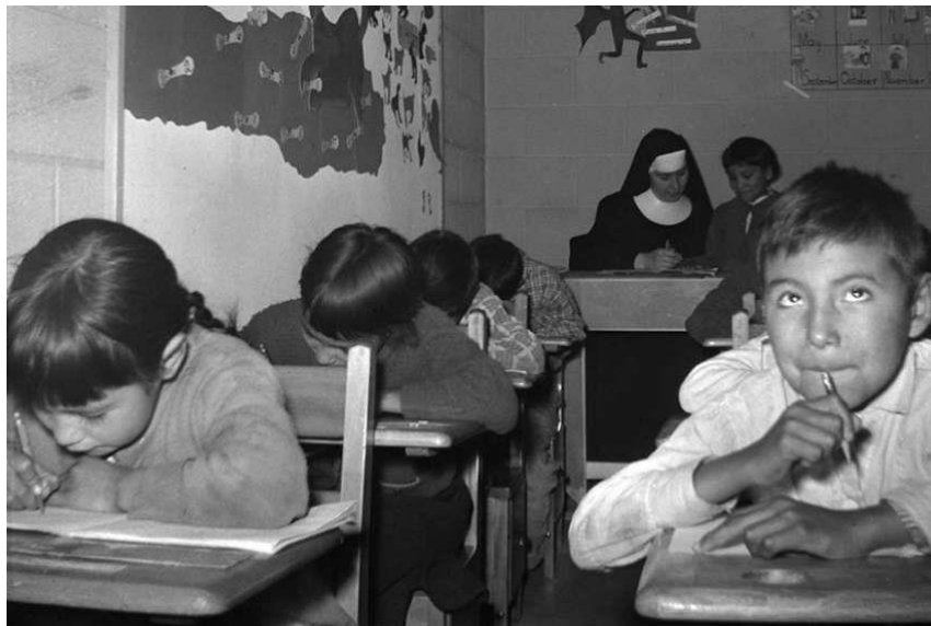
A young boy with other students and a nun in a classroom at the Pukatawagan Indian Residential School, Manitoba, circa 1960.