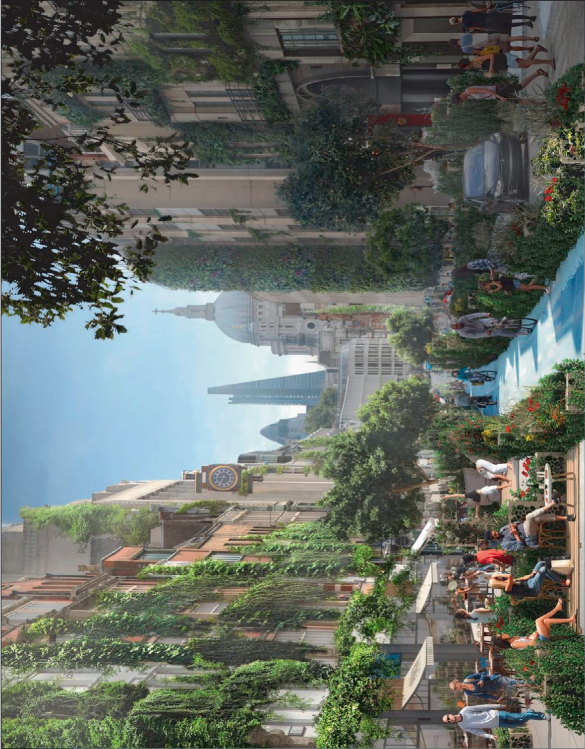
Wimberly, Allison, Tong & Go, www.watg.com (architectural firm), 10 October 2017