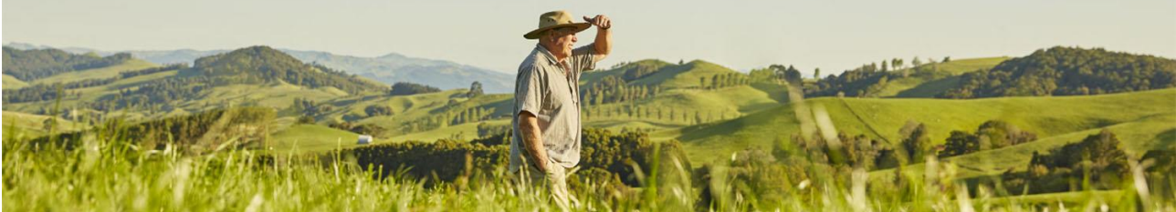
Homepage of Taste Pure Nature – New Zealand Beef & Lamb, 2020